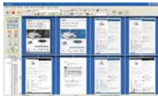
The AvScan 5.0 main screen

-The Intelligent Document Management Tool